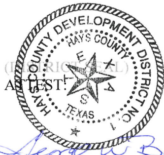
Secretary, Board of Directors

PASSED AND APPROVED this 12 th day of September, 2024.